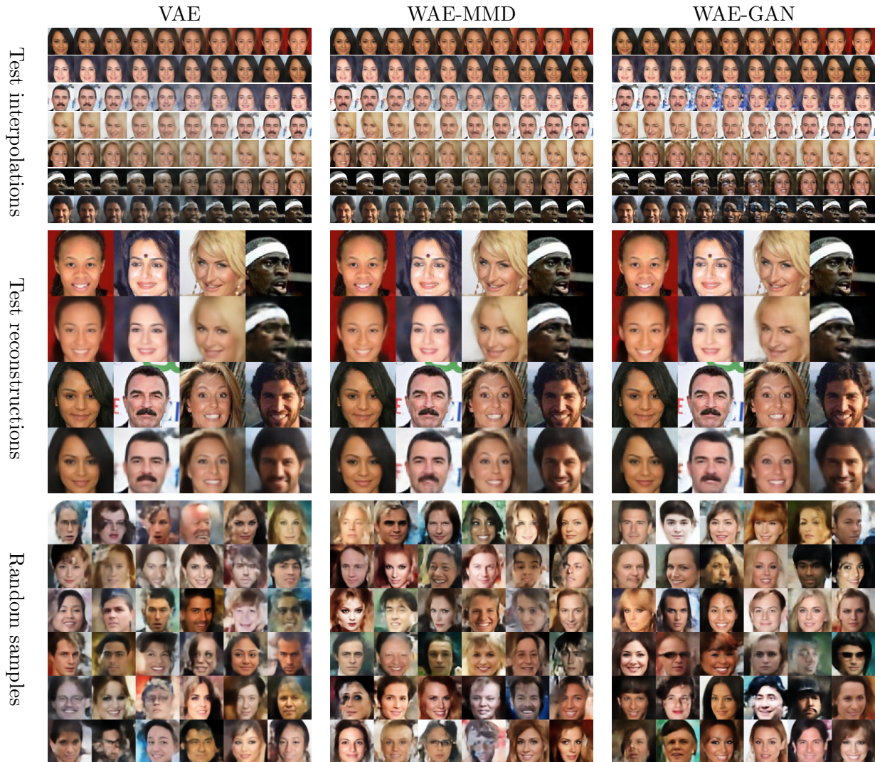
Figure 3: VAE (left column), WAE-MMD (middle column), and WAE-GAN (right column) trained on CelebA dataset. In “test reconstructions” odd rows correspond to the real test points.

WAE-GAN and WAE-MMD specifics In WAE-GAN we used discriminator D composed of several fully connected layers with ReLU. We tried WAE-MMD with the RBF kernel but observed that it fails to penalize the outliers of Q_Z because of the quick tail decay. If the codes \tilde{z} = \mu_\phi(x) for some of the training points x \in \mathcal{X} end up far away from the support of P_Z (which may happen in the early stages of training) the corresponding terms in the U-statistic k(z, \tilde{z}) = e^{-\|\tilde{z}-z\|_2^2/\sigma_k^2} will quickly approach zero and provide no gradient for those outliers. This could be avoided by choosing the kernel bandwidth \sigma_k^2 in a data-dependent manner, however in this case per-minibatch U-statistic would not provide an unbiased estimate for the gradient. Instead, we used the inverse multiquadratics kernel k(x, y) = C/(C + \|x - y\|_2^2) which is also characteristic and has much heavier tails. In all experiments we used C = 2d_z\sigma_z^2 , which is the expected squared distance between two multivariate Gaussian vectors drawn from P_Z . This significantly improved the performance compared to the RBF kernel (even the one with \sigma_k^2 = 2d_z\sigma_z^2 ). Trained models are presented in Figures 2 and 3. Further details are presented in Supplementary C.